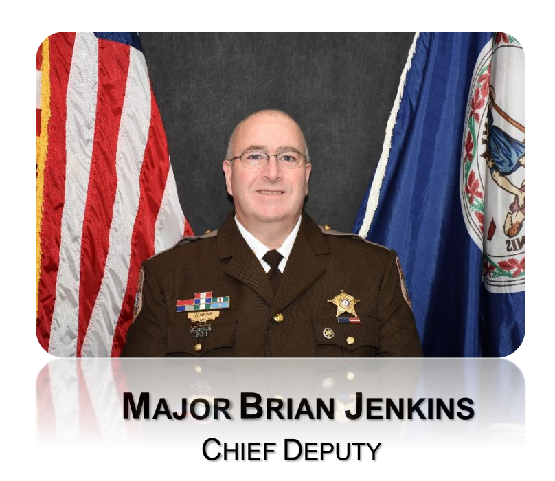
PATROL / COURTS